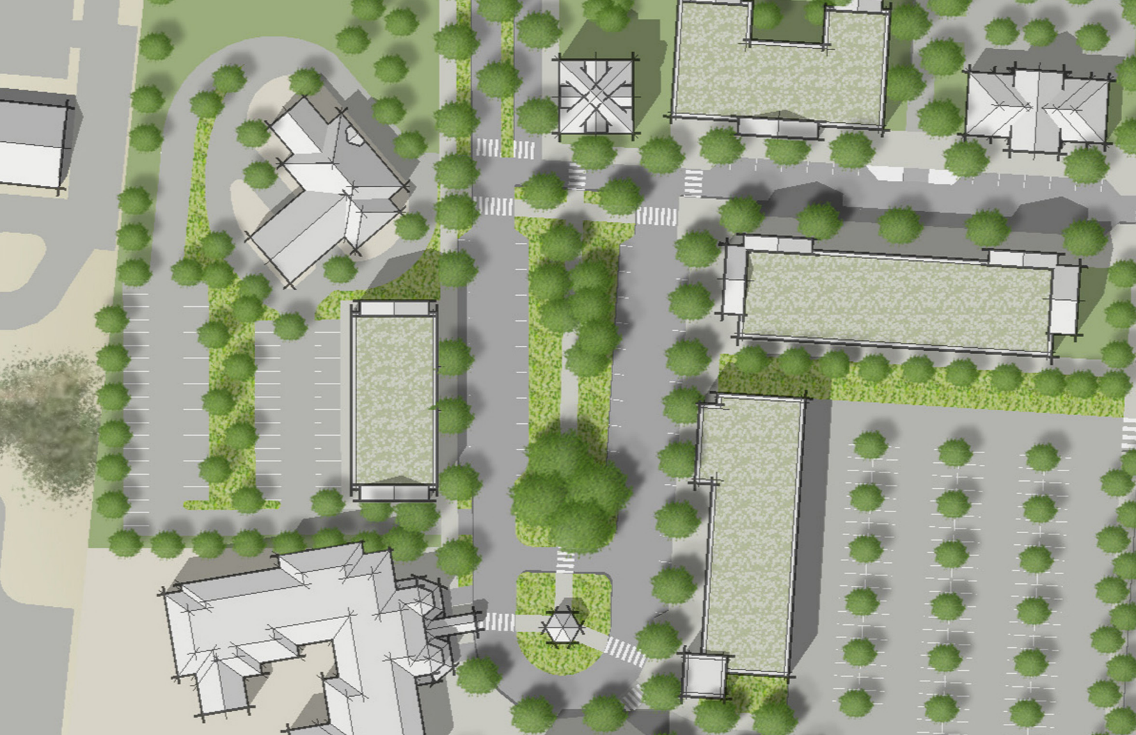
Site Planning Detail -South Windsor, CT Wallace Roberts & Todd, LLC