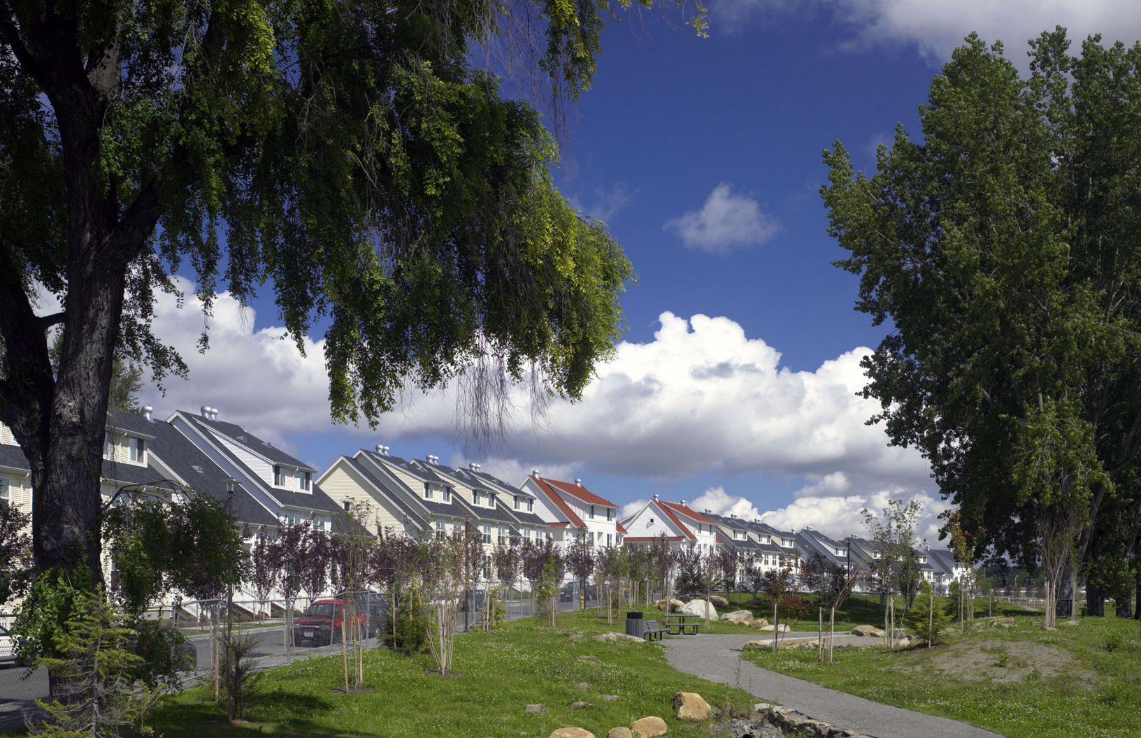
Othello Station at New Holly - Seattle, WA Wallace Roberts & Todd, LLC with WRT/Solomon ETC