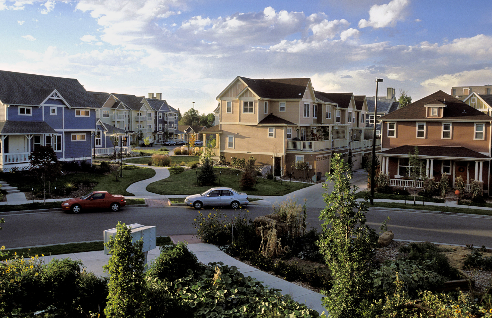
Highlands' Garden Village Mixed-Use and Mixed-Income Community - Denver, Colorado Jonathan Rose Companies