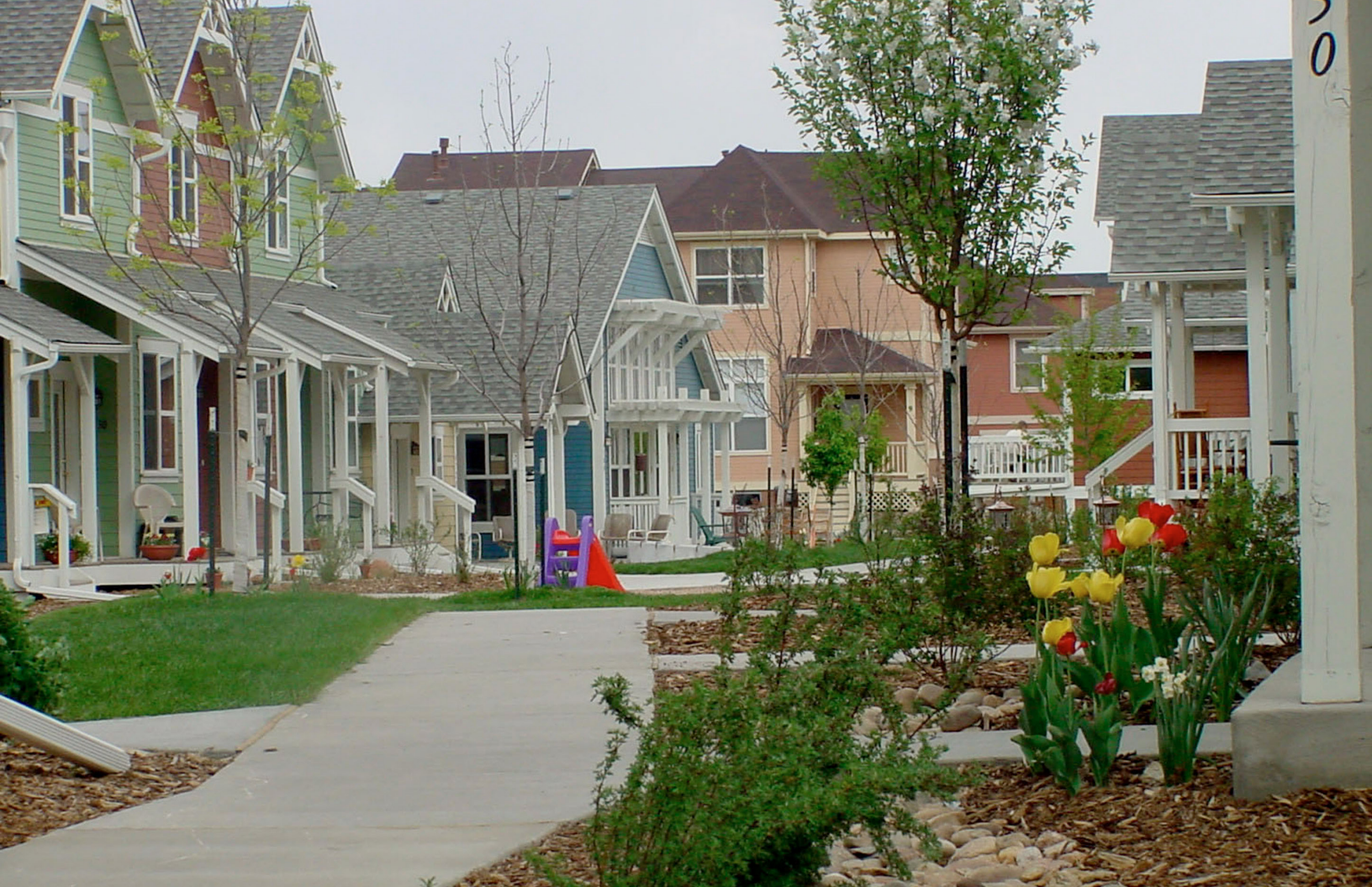
Highlands' Garden Village, Co-housing - Denver, Colorado Jonathan Rose Companies