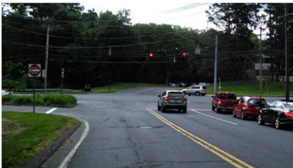
Farmington Avenue at Talcott Notch / Old Mountain

Feedback from this Public Meeting will help support the existing conditions assessment being prepared by the Consultant Team. The next step, Assessment of Future Conditions, will begin in January 2017. An overview of the existing and future deficiencies and preliminary improvement alternatives will be presented at the next Public Information Meeting in mid-2017.