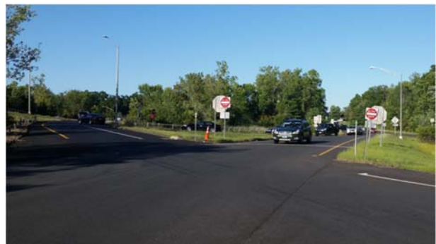
Colt Highway/South Road at Interstate 84 On-Ramp