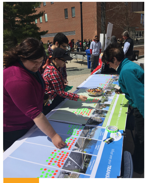
The public outreach program for the Eastern Gateways Study included a series of "pop-ups" where study team members set up a table at community events, such as UConn's Earth Day celebration. This approach allowed CRCOG to publicize the study while soliciting feedback from community members at an event they were already attending.