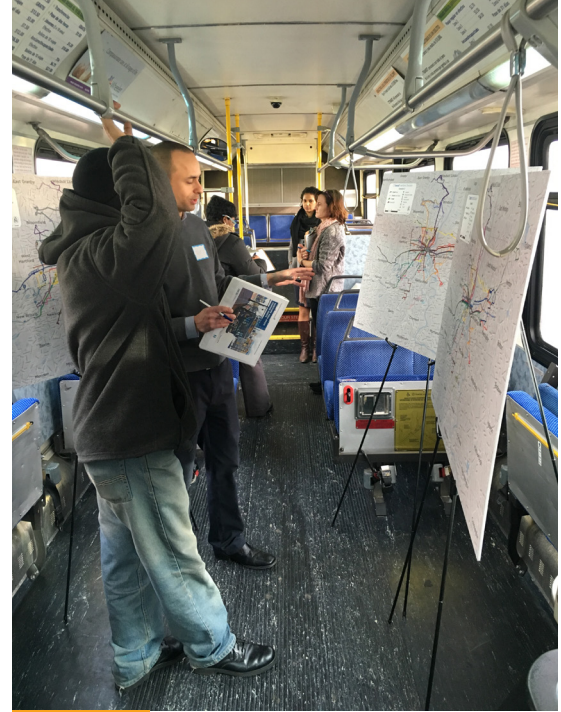
As part of its Comprehensive Transit Service Analysis, CRCOG held information sessions at bus stops. Bus riders were welcomed onto a CTtransit bus where they could view study materials and maps, discuss alternatives with study team members, and take a survey regarding their transit preferences.

CRCOG holds public meetings, workshops, and open houses to provide opportunities for the public to learn about transportation plans, projects, and programs. These events also allow CRCOG to gather input that can help inform transportation decisions. CRCOG encourages the public to comment and provides multiple ways for individuals to give input and share ideas. Oral and written comments may be provided at meetings, and written comments may be submitted by mail, email, fax, or through the website comment form. CRCOG follows specific guidelines to allow reasonable time for the public to comment on plans, projects, and programs. In addition, CRCOG provides a summary of responses to comments submitted by the public.