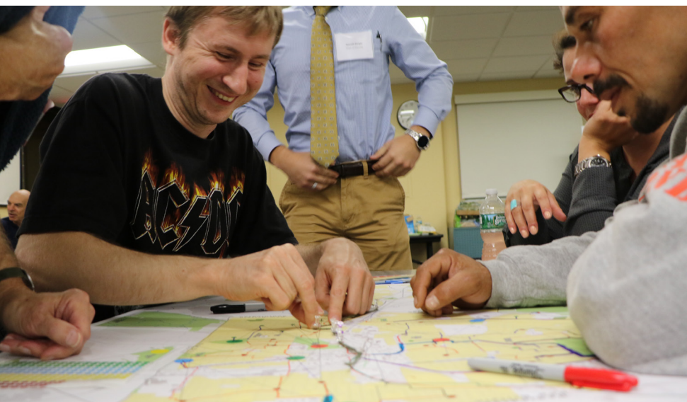
Members of the public in New Britain draw potential bicycle and pedestrian routes between downtown New Britain and the center of Plainville during a collaborative workshop for the Gap Closure Trail Study. Participants were asked to trace routes, place stickers on activity centers, and circle potential roadblocks.