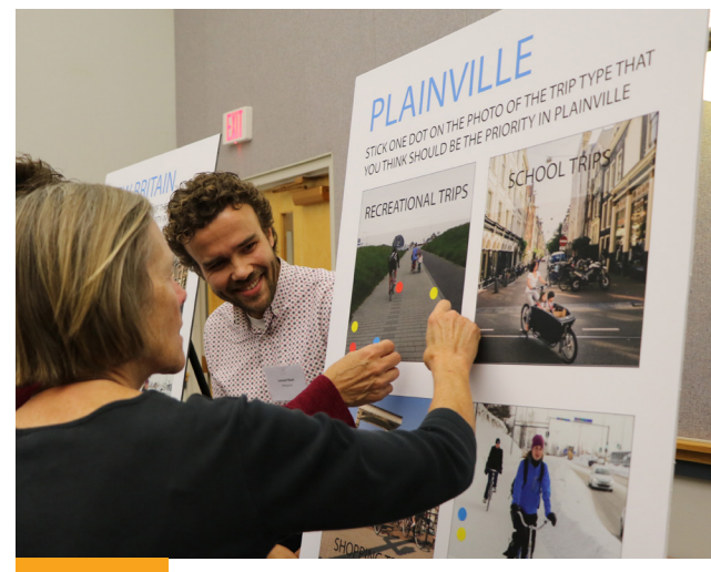
Attendees at a collaborative workshop place stickers on a board identifying the types of trips they think should be prioritized in the Gap Closure Trail Study, which seeks to find new connections between regional multi-use trails.

Each of these events may include surveys or comment cards to provide opportunities for additional public input.