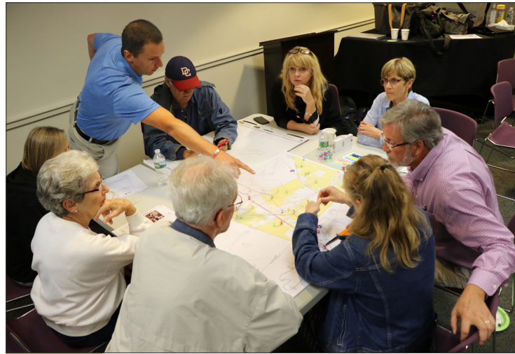
The study team on the Gap Closure Trail Study leads participants in Plainville through a mapping exercise. Participants were asked to connect important locations in their community using thumb tacks and pieces of yarn in a process referred to as a “Star Analysis”.

This Public Participation Plan serves as a guide for citizens to understand CRCOG's public participation approach and how to become involved in shaping the future of transportation for the 38 communities in the Capitol Region.