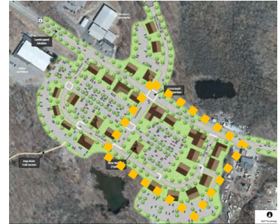
See Section 4.1.3 for more details about the recommendations in the Bolton Crossroads Focus Area.

Four properties would be affected by the implementation of Phase 3 project elements.