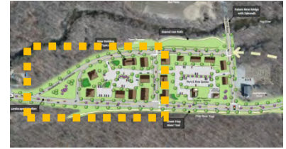
See Section 4.1.5 for more details about the recommendations in the Historic Focus Area.

Three properties would be affected by the Phase 2 project elements, including one residential property requiring relocation.