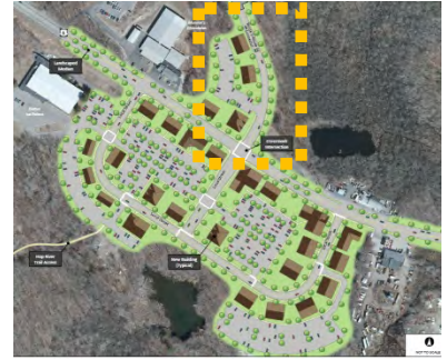
See Section 4.1.3 for more details about the recommendations in the Bolton Crossroads Focus Area.

It is possible to implement Phase 1 as two separate initiatives with the first initiative restricted to constructing the southern half of the new connector that is located exclusively on State-owned property, ending in a temporary cul-de-sac. The second initiative would construct the northern half of the connector across privately-owned lands to make the full connection between Route 6 and Route 44.