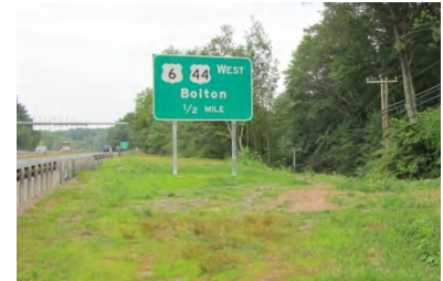
See Section 4.1.2 for other recommendations in the Bolton Notch Focus Area.

The alignment of the path should minimize potential impacts to rights-of-way and existing utilities. Where feasible, the alignment should also be consistent with the other recommendations in the Bolton Notch Focus Area.