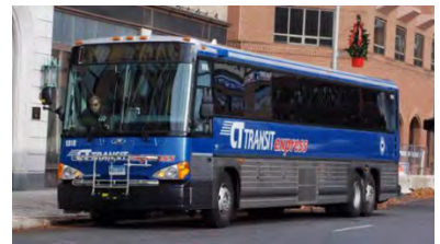
See Section 4.3.4 for additional details on transit recommendations.