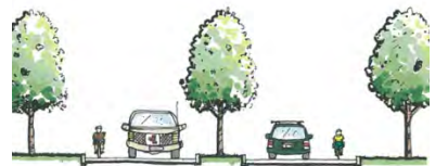
See Section 4.1.3 for more details about the recommendations in the Bolton Crossroads Focus Area.

This project includes providing landscaped medians (where possible considering left turn lanes and access needs); 11 ft travel lanes, 5 ft outside shoulders, and street trees along Route 6 within the limits of the future Bolton Crossroads village.