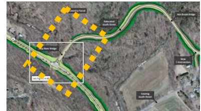
See Section 4.1.4 for more details about the recommendations in the Coventry Ridge Focus Area.

One property would be affected by the implementation of Phase 1 project elements.