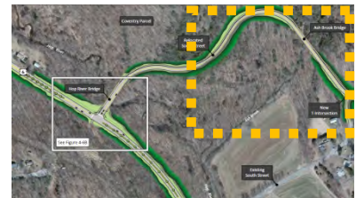
See Section 4.1.4 for more details about the recommendations in the Coventry Ridge Focus Area.

Four properties would be affected by the implementation of Phase 2 project elements.