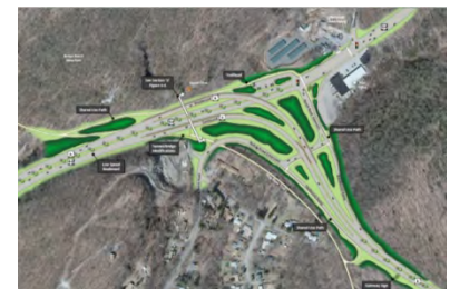
See Section 4.1.2 for more details about the recommendations in the Bolton Notch Focus Area.

This project would implement the recommendations of the preferred concept for the Bolton Notch Focus Area (see Section 4.1.2 for details) and would include: