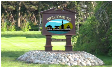
See Section 4.1 for other recommendations in the Bolton Notch, Historic Andover, and Lighthouse Corners Focus Areas.

It is anticipated that each of these signs would be located within State-owned rights-of-way and would require maintenance agreements and Highway Encroachment Permits from CTDOT prior to installation.