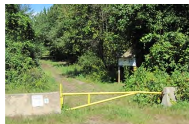
See Section 4.3.3 for other Hop River Trail improvement recommendations.

In conjunction with this project, trail access from side roads should be improved to replace existing large boulders and gates that serve as vehicular barriers with measures, such as bollards, that are less hazardous to users.