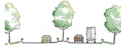
See Section 4.1.2 for more details about the recommendations in the Bolton Notch Focus Area.

This project requires the reclassification of the section of Route 6/44 between the existing eastbound Route 6 flyover and Notch Road from a principal arterial – expressway to principal arterial – other.