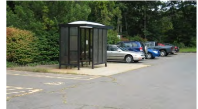
See Section 4.3.4 for additional details on transit recommendations.