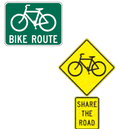
See Section 4.3.2 for details about bicycle improvements.