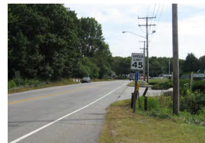
See Section 4.1.6 for more details about the recommendations in the Lighthouse Corners Focus Area.

Depending on the urgency of the issue, the mitigation could be implemented as part of the roundabout improvements at Lighthouse Corners (see project Co-5, page 5-15).