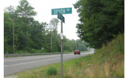
See Section 4.2.1 and Table 4-1 for location-specific recommendations.

It is anticipated that these improvements could be implemented together as an independent corridor improvement initiative, or as part of the next planned pavement rehabilitation project(s) in the corridor.