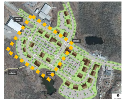
See Section 4.1.3 for more details about the recommendations in the Bolton Crossroads Focus Area.

Three properties would be affected by the implementation of Phase 2 project elements.