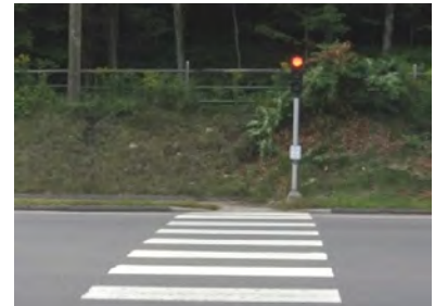
See Section 4.1.5 for other recommendations in the Historic Andover Focus Area.