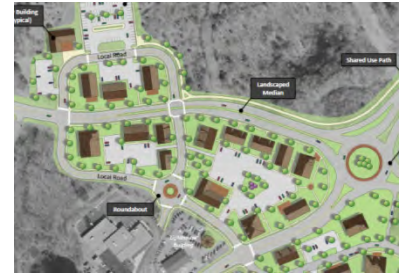
See Section 4.1.6 for more details about the recommendations in the Lighthouse Corners Focus Area.

Four properties would be affected by implementation of the Phase 2 project elements.