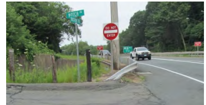
See Section 4.1.2 for other recommendations in the Bolton Notch Focus Area.