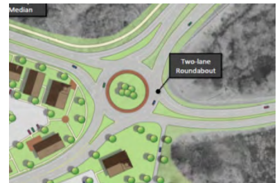
See Section 4.1.6 for more details about the recommendations in the Lighthouse Corners Focus Area.

One property would be affected by the implementation of the Phase 1 project elements.