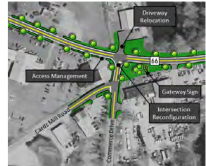
See Section 4.2.1 for other side road intersection improvements.

The project could include new gateway signing in this location that is consistent with the recommendations of the Corridor Master Plan from REDC’s 2010 Study.