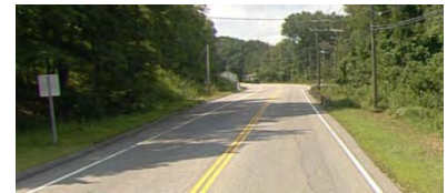
See Section 4.2.3 for more details about safety improvements on Route 66 East.

Initiative 2: Curve Safety Measures. Cost: $75,000. Initiative 2 includes: