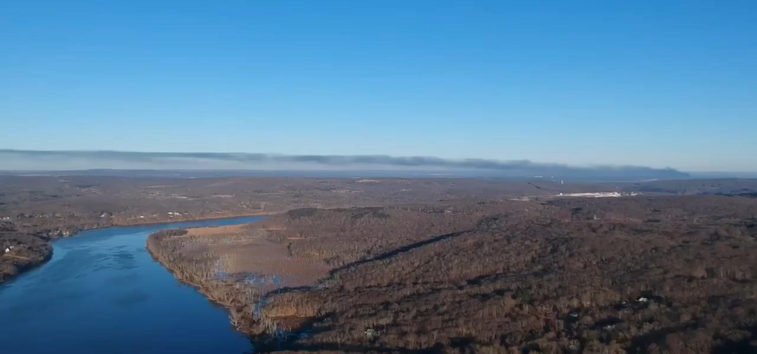
View from Haddam Neck – Gillette Castle