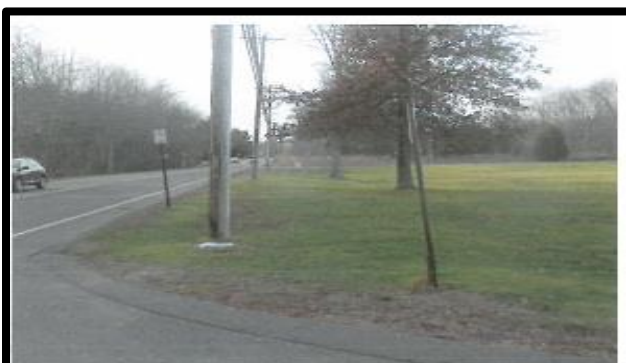
The new multi-use trail would begin to the west of the Suffield Middle School driveway.

The additional funding also includes increased unit costs for the three-rail wood fence at $15,900, HMA at $26,200 and a variety of other minor unit cost increases. The additional costs combined with increases to percentage based estimating items (such as minor items, inflation, contingencies) resulted in the total estimated cost increase of $184,400.