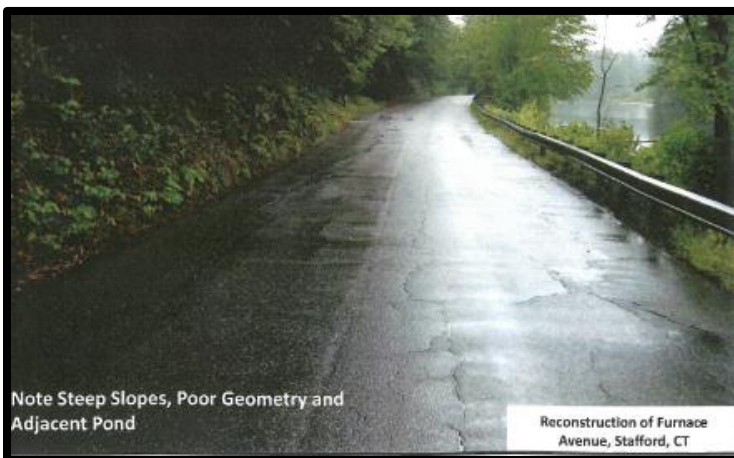
Note Steep Slopes, Poor Geometry and Adjacent Pond

During the preliminary design phase, the Town conducted a hydraulic analysis that indicated the anticipated 1,500 linear foot of stormwater drainage improvements needed to be extended 1,200 linear feet. These additional drainage improvements, coupled with unit costs increases added $338,000 to drainage pipe and structure costs. Additionally, riprap was needed to stabilize the drainage swales and the embankment along the pond for an additional $85,500 and gravel fill was added under the riprap and in storm sewer trenches for $157,500.