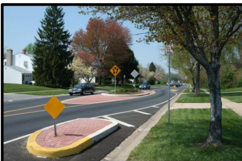
Modified Chicane - Delaware

The Town of Bloomfield is requesting a LOTCIP scope modification/funding transfer request of $1,622,400 of $1,934,000 from two previously Transportation Committee approved LOTCIP Pavement Rehabilitation Projects located on Woodland Avenue to a Traffic Calming Project located on the same roadway. The goals of revision from pavement rehabilitation to traffic calming measures are to improve safety for all users, especially for pedestrians, bicyclists, and residents and to improve the quality-of-life factors in the neighborhood. Woodland Avenue is also identified in the “Capitol Region Complete Streets Plan.” If approved, the Town will concede to limit any award in the 2023 LOTCIP Solicitation to a cap of $2.7 million.