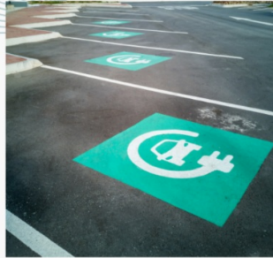
Electric Utility Services