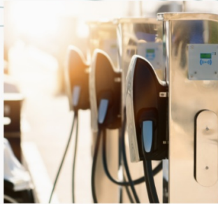
Siting, Permitting and Construction