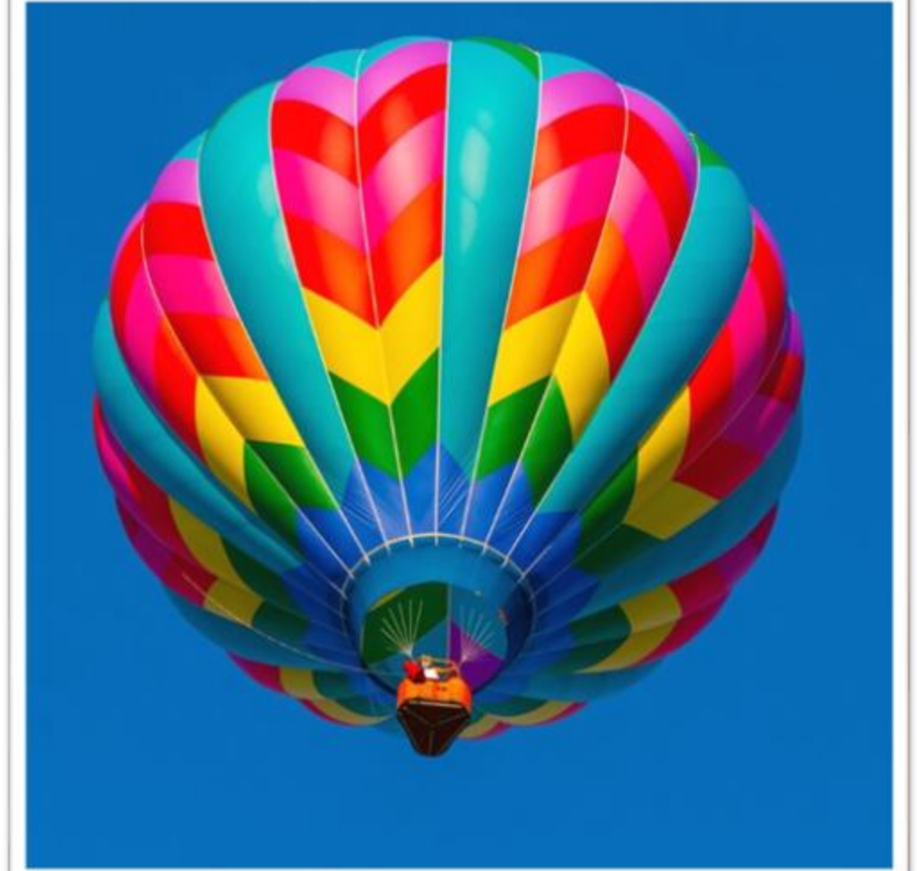
Plainville Fire Company Hot Air Balloon Festival.

https://crcog.org/event/policy-board-58/